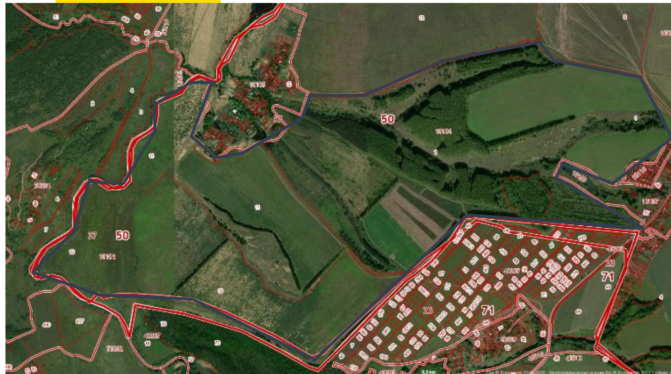
Cadastral plots of the object (highlighted in blue)

Entry to the sites is carried out either through the territory of the village of Peretrutovo, or through the village of Ledovskie Vyselki, along dirt roads.